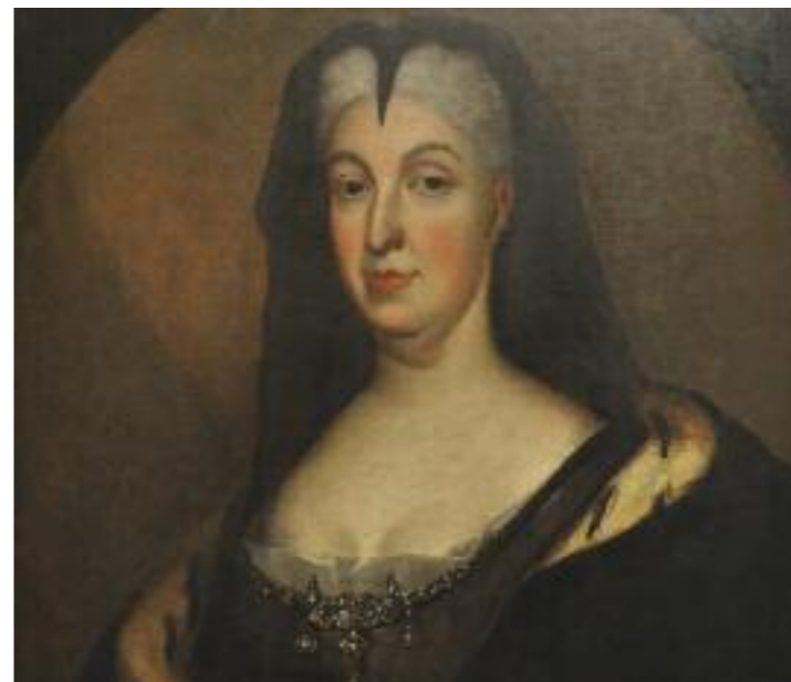
Portrait of the margravine Sybilla Augusta (1675–1733)

The entry to the residential building in the south wing was highlighted by a sweeping flight of stairs with a balcony resting on four columns crowned by the coat of arms of the alliance, rich in stucco. The opulent façade paintings as well as the paintings in the halls by Lucca Antonio Colomba and the stucco work by Riccardo Retti were completed in 1731.