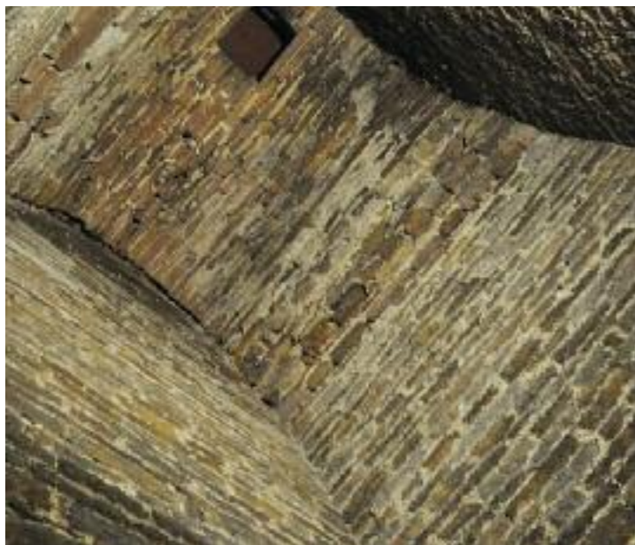
View to the ceiling of the medieval keep

It is quite certain that the area has been altered and enlarged several times throughout the centuries. Older, dilapidated buildings or those