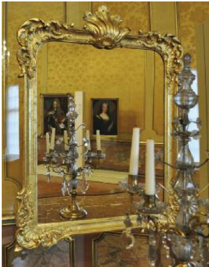
Permanent exhibition showing the history of the palace