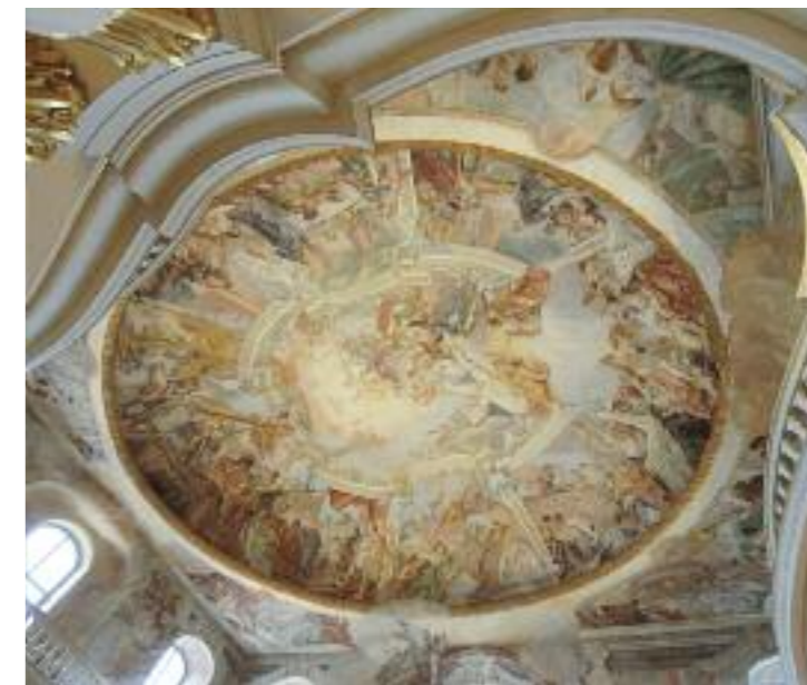
Ceiling painting in the palace chapel

After the Margravine's death, the castle was seldom used. As early as the period of the reign of the Margrave August Georg (1706–1771), the last margrave of the catholic line of Südbaden, the first structural damage to the castle appeared in the Rittersaal and in the chapel. In 1771, the whole territory of Baden-Baden passed to the protestant Margrave Karl Friedrich in Karlsruhe. Maria Viktoria, the last Margrave's widow, lived in her mother-in-law's rooms till 1775. After she had left, most of the works of art and the furnishings were taken away and the castle was mostly used as a