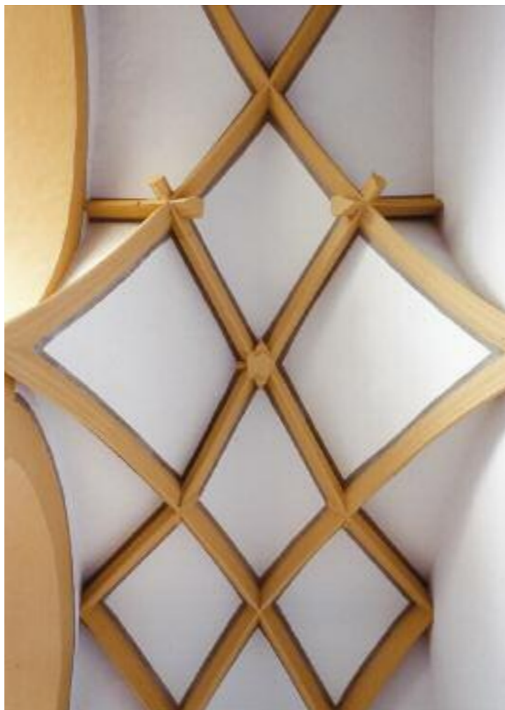
View into the ribbed vault of the arcades

which had become too small were either replaced by new buildings or enlarged by the addition of an annex. Several historical sources tell us about the purchase of land to enlarge the castle area. Alongside residential buildings and outbuildings, a small kitchen garden was laid out.