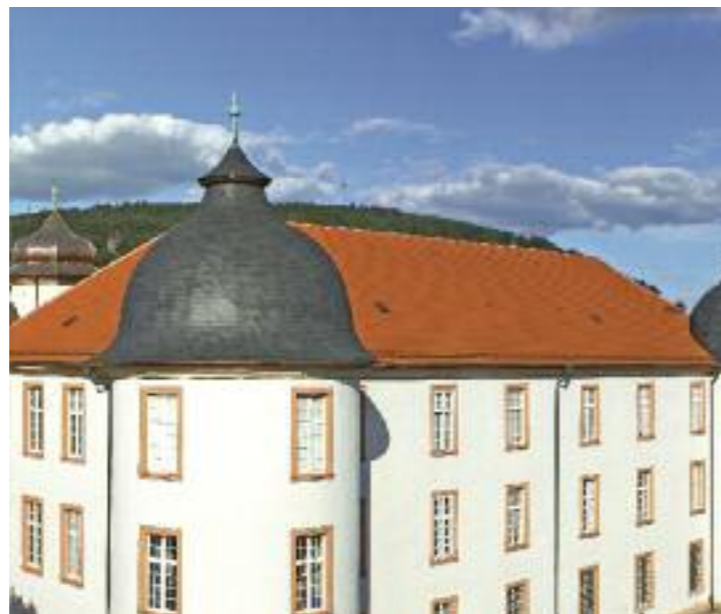
The renovated palace seen from the south-west

festivities because of its high quality. During the old town restoration which started at the end of the sixties, a general restoration of the castle was started. It was completed, for the time being, in 1982 with the restoration of the baroque rooms in the southern wing.