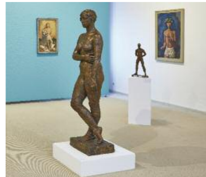
Current exhibition of collected works from Karl Albiker and Karl Hofer

Tip: A large programme which includes expert guided tours in the historic centre of Ettlingen, in the palace and the museums ensures an eventful visit.